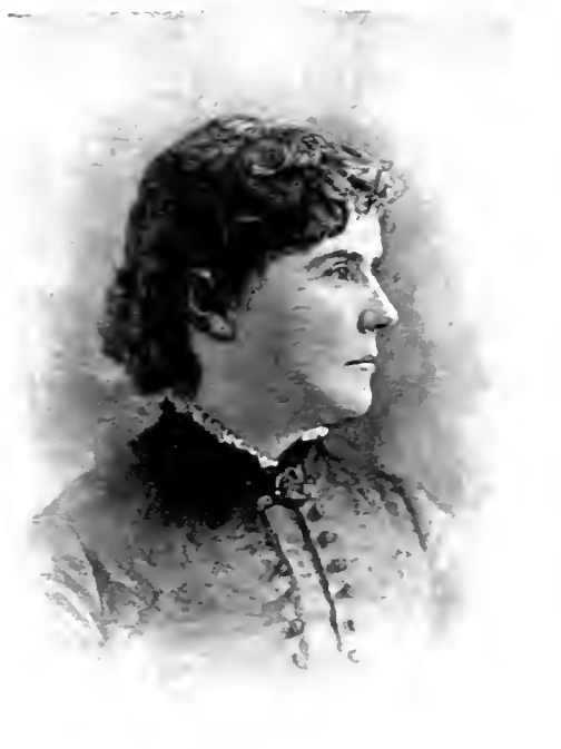
CONSTANCE FENIMORE WOOLSON.